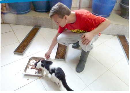
Trainee in the project